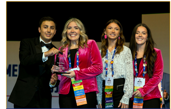
FBLA Collegiate NLC Attendance

The FBLA National Leadership Conference (NLC) brings together thousands of decision makers, administrators, teachers, and student members. FBLA members and advisers initiate projects and programs, solicit bids, and make purchasing and fundraising decisions based on what they see in the exhibit area. Student members are reviewing colleges and universities, looking at chapter advancement opportunities, and seeking internships and employment. Join FBLA for the 2023 NLC Conference in Atlanta!